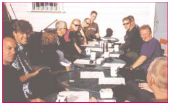
Breakfast in San Francisco

Having endured a long flight on a large virgin silver bird to a harbour town called San