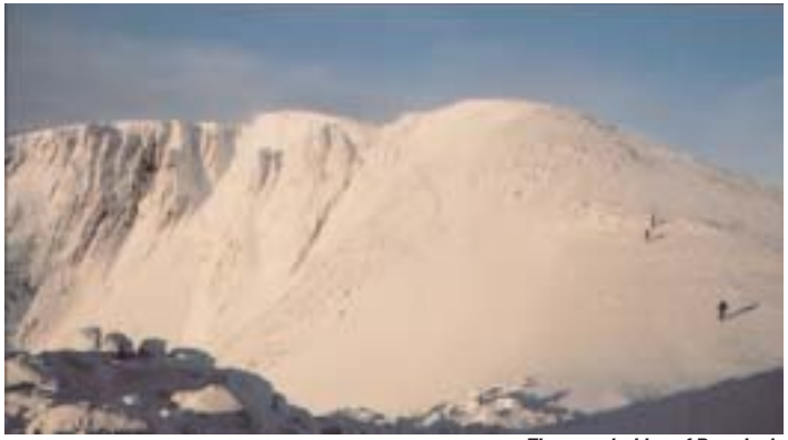
The superb ridge of Braeriach

else on our route, nor had there been the day before because the snow was unmarked by the footprints, although we spotted rabbit tracks just below the summit of Braeriach. So we chatted, lunched and fell silent. We slogged up and down a boulder strewn slope to Sgor an Lochan Uaine (the Angel's peak). We slogged up and down a boulder strewn slope to Cairn Toul. The others pressed on to Devil's Point, while I waited at top of Coire Odhar, having walked enough. It was a decision I regret-