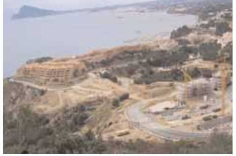
Beautiful site (view from Toix)

Hazy sunlight Drifting clouds A quiet sleeping sea And I lost in thought Taste the warmth of the moment And reach beyond the everyday