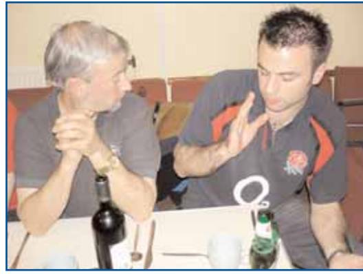
Using this comfortable action I found that I could comfortably sink a dozen pints after the game