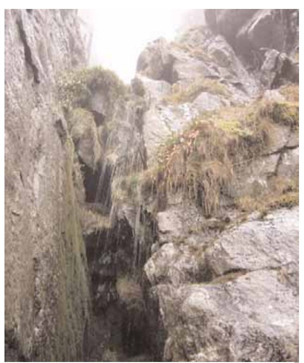
A typical pitch. They,re not icicles ^ it,s a waterfall!