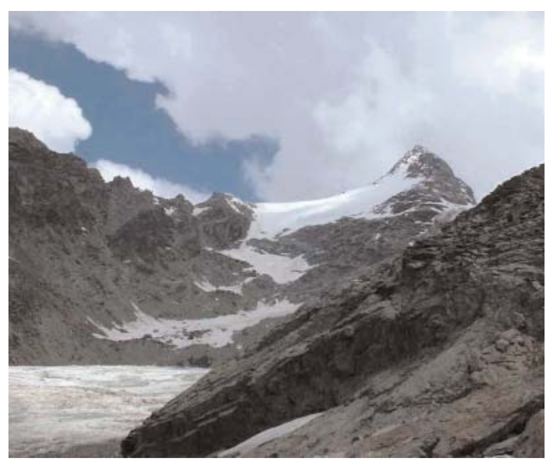
The Fletschhorn as seen from the Weissmies Hut

This was the last mountain I climbed in the Saastal and a good one to go out on. I'd recommend this route to anyone but your better off talking to the hut warden's dog than reading the guidebook!