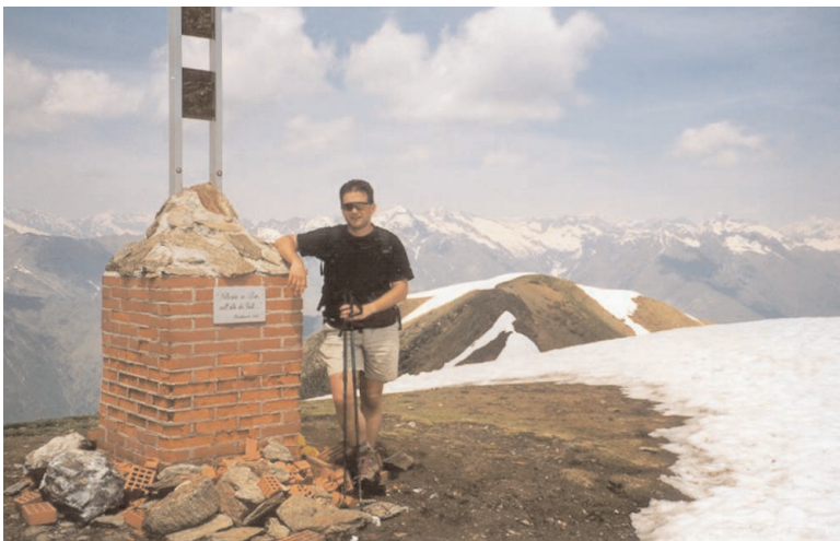
The author, posing on top of the hill.

sheep, plodding over snowfields and running (for some of us) down grassy slopes. Unfortunately time was progressing and we were eventually forced to descend. A real shame, for the continuation of the ridge looked very enticing.